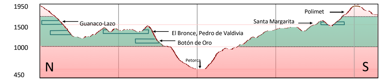
Figure 4. Regional profile of elevation (vertically exaggerated)

At El Bronce the steeply-dipping lenses range 100-600 m in length, 200-400 m in depth, and 1-20 m in width (Camus et al., 1991). The vein mineralogy in El Bronce is comprised of quartz, pyrite, sphalerite, galena, tetrahedrite, barite and calcite. Ore shoots occur as massive sulfide fillings, stockworks and disseminations. One significant difference at Polimet is the abundance of chalcopyrite in the vein system, with an average of 3.4% copper content reported from the small number of point samples shown below in Table 4. The 3.4% Cu figure is higher than the recorded average sales figure showing 2.0% Cu from a much larger sample size, and the higher figure cannot be considered representative of the system as a whole. It appears that the surface geology of