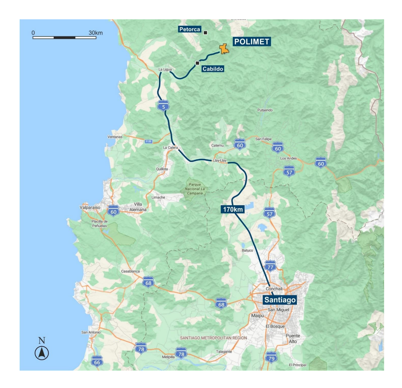
Figure 1. Project Location